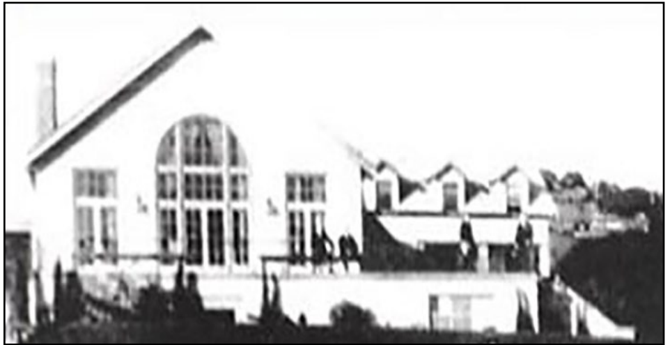
This photo shows the south wall of the ballroom of the Belle Monti Country Club in 1925. In the early 1960s, those windows were removed and an annex was added to accommodate the pipes, blower and other equipment needed for the installation of the pipe organ that the late Gary Brandenburg rebuilt for the church.

Until final design steps are taken, the facade of brass organ pipes behind the altar are expected to remain as the centerpiece of the chancel.