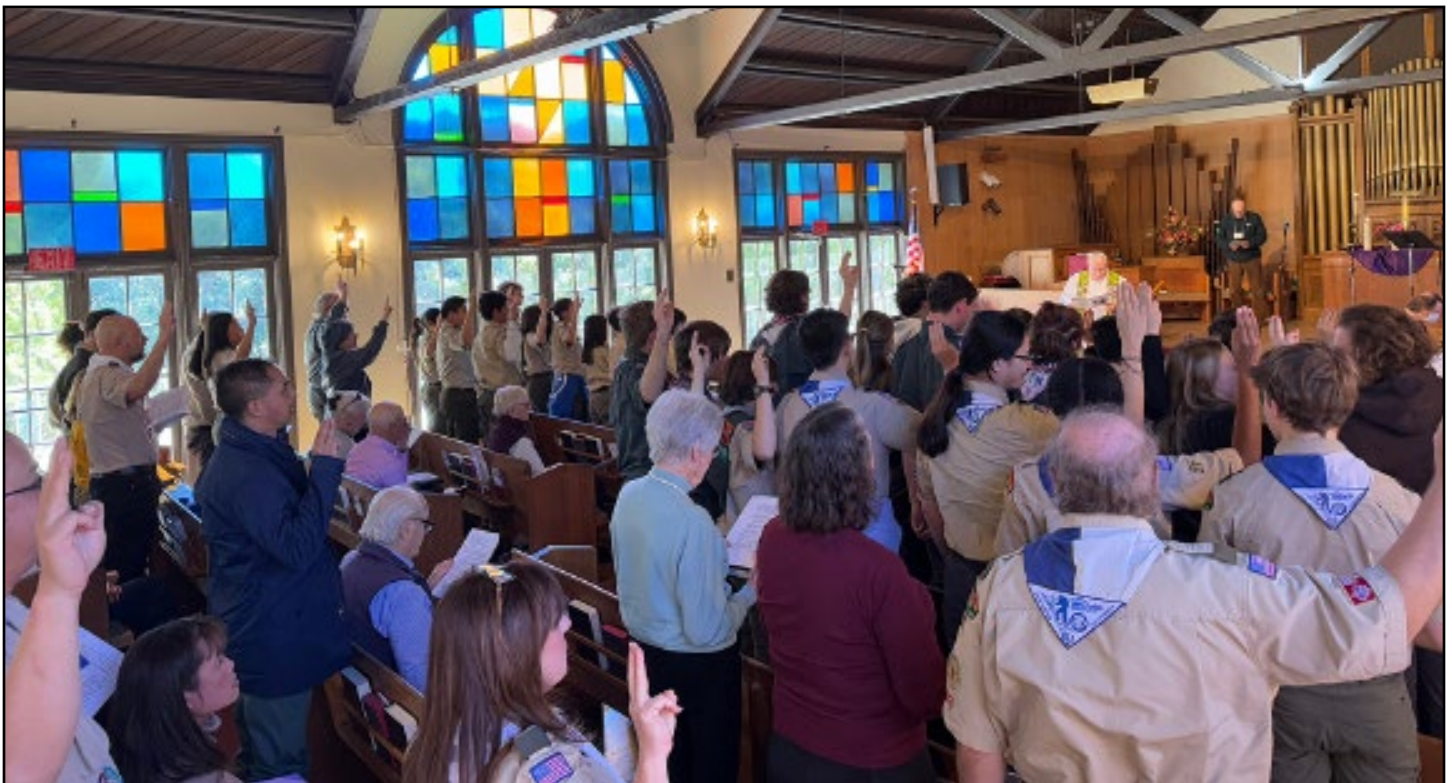
Troop 27 Scouts filled the Sanctuary last year on Scouting Sunday, typically the second Sunday of February.