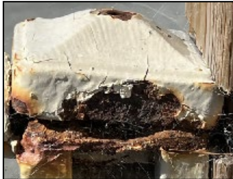
Examples of railing failures.