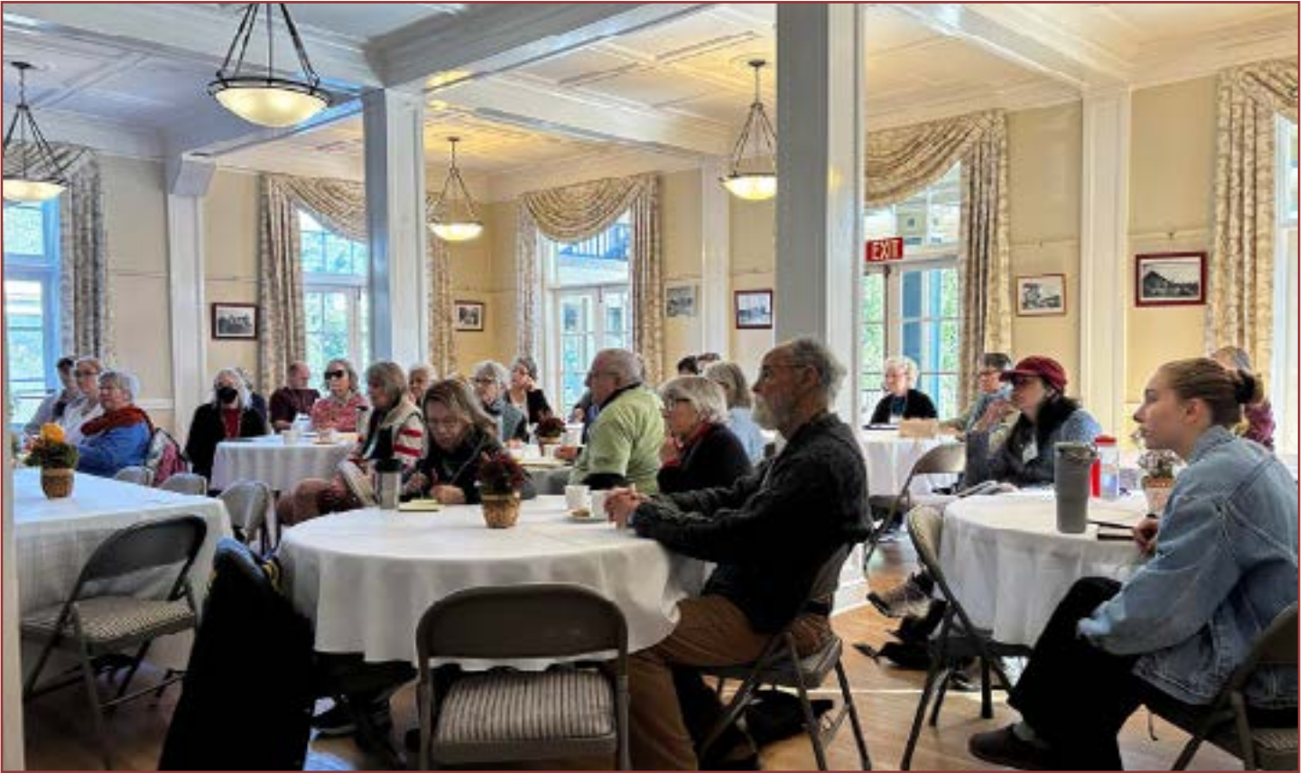
People from throughout San Mateo County gathered in the CCP Dining Room to hear how to resist ICE arrests.

751 Alameda de las Pulgas, Belmont CA 94002 • 650-593-4547 • Office@ccpeninsula.org • www.CCPeninsula.org