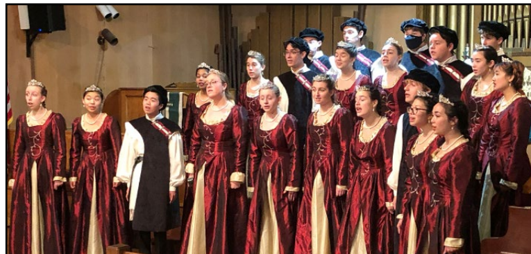
The Madrigal Singers will perform at 5 p.m. Dec. 8 at CCP.

The theme for Advent, which begins Dec. 1 this year, will be Words for the Beginning, from the Sanctified Art worship resources.