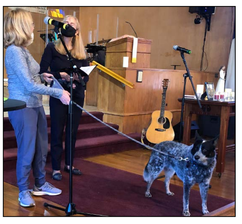
CCB gathers once again for the annual Blessing of the Animals