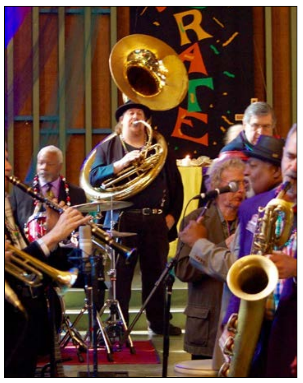
Jazz performers at Plymouth Jazz & Justice UCC in Oakland.

The demographics began to change, as more diverse and younger people joined the original members. The dinners were very successful in creating stronger ties among