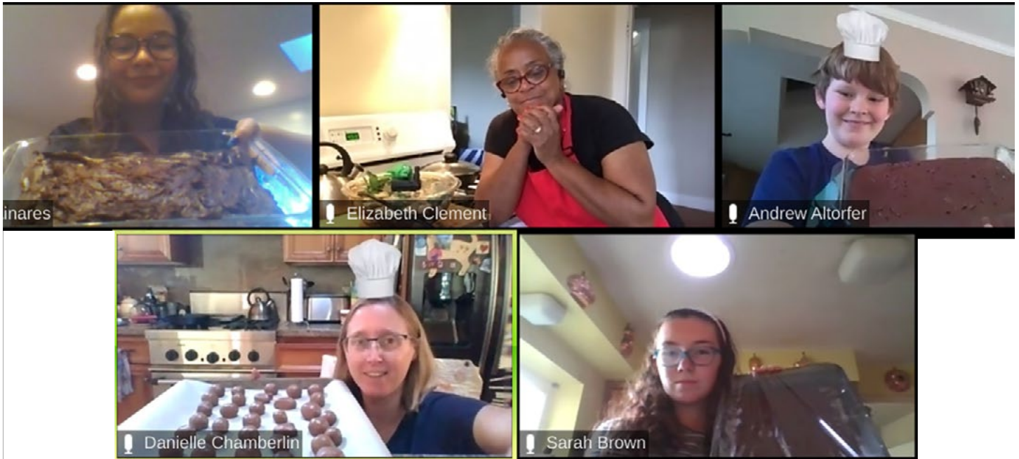
Making fudge from the Chocolate Fest cookbook was a Zoom project from a recent youth group meeting.